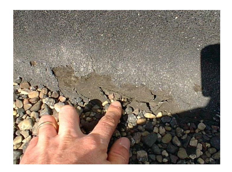
F-102 Field Membrane - puncture/Hole/tear # 3 All holes in the membrane are considered high severity due to their high leak potential.