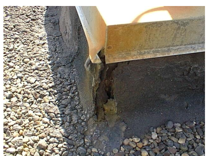
P-100 Penetration - deteriorated membrane # 4 The flashing membrane is deteriorated and should be replaced to avoid further degradation.